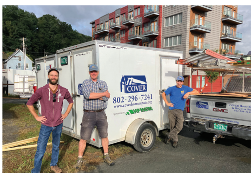
COVER Home Repair vehicles, then and now.