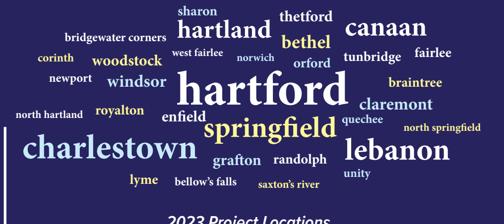
Towns with the highest number of home repairs by COVER appear in larger font.

Repair projects are located within a 45-minute driving distance from White River Junction in VT and NH. Some volunteers prefer to help in their own town or nearby, and others don't mind driving the distance. It is up to you! We can help coordinate carpooling for volunteers.