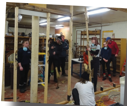
COVER tears down walls

COVER Home Repair sends our thanks to the entire Kendal Community.